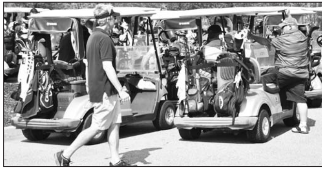
Rotary Club Tournament