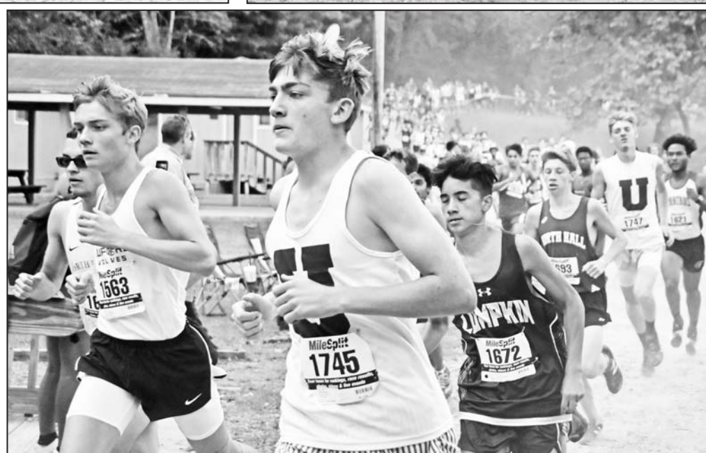
Union County Cross Country in action earlier this month at Unicoi State Park - the same location as next week's region meet.